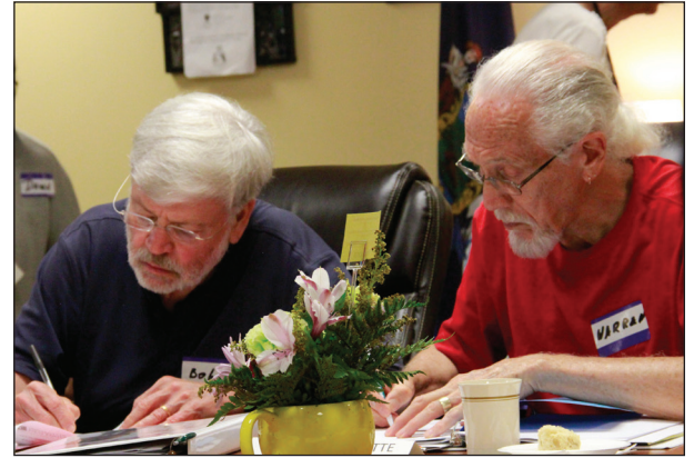
With deep gratitude to the Maine Veterans' Home, Scarborough, for providing space and three wonderful meals.

From October to June, 53 Vet to Vet Maine Volunteers spent more than 2,500 hours with 59 Veterans who needed a friend. Vet to Vet volunteers have helped their veterans: