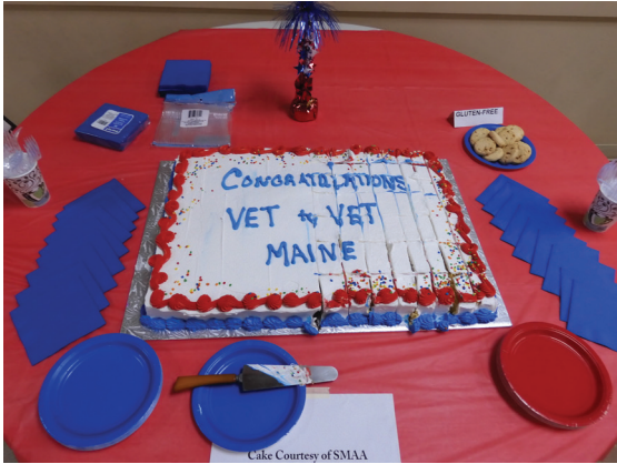
Cake Courtesy of SMAA