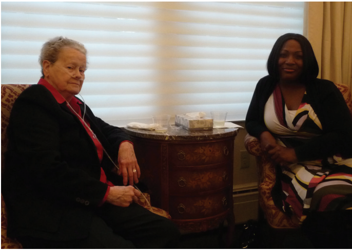
With thanks to Jones, Rich & Barnes for the fabulous Beer & Wine Tasting fundraiser for Vet to Vet Maine